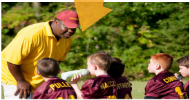
Like coaches helping their players at practice.

Summative assessments, like tests, projects, and presentations, help determine if a student has mastered the standards for their grade level or course.