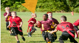
Like players executing skills and plays on game day.